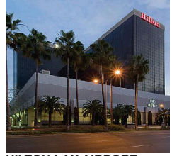
HILTON LAX AIRPORT

INCLUDES: • 3 nights accommodation and tax • Choice grandstand seats near the start of the Rose Parade. Our seats are located on Colorado Blvd., just after the turn from Orange Grove where the Parade begins. This is an excellent vantage point for viewing and picture taking of the many beautiful floats. • Comfortable deluxe motorcoaches to the Parade on January 1 • Full American Breakfast January 1 • Box lunch and refreshments January 1 • Souvenir pin • Hospitality desk service at hotel • Host assistance on January 1 • All taxes and gratuities (except airport and hotel portage)