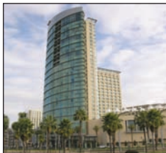
OMNI SAN DIEGO

This newly renovated, boutique-style hotel is situated in the heart of San Diego's Little Italy district. Located within walking distance of Balboa Park and centrally located to many of San Diego's most famous attractions. Take a quick trip to Seaport Village - a picturesque waterfront setting with specialty shops. Explore the Gaslamp District for entertainment and dining. Hop on the Trolley and enjoy access to Old Town and Belmont Park. Use our shuttle service to SeaWorld and the San Diego Zoo. Guest rooms have stylish appointments and modern conveniences. Workout in our fitness center, or swim in the outdoor swimming pool. Dine at First Avenue Grill.