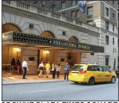
CROWNE PLAZA TIMES SQUARE