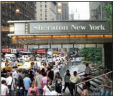
SHERATON NEW YORK

Broadway shows, Rockefeller Center, Radio City Music Hall, Carnegie Hall and Fifth Avenue are nearby. Enjoy the city's only revolving rooftop restaurant. In the heart of Times Square, a 37-story atrium, four restaurants, 2000 rooms with city views.