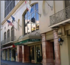
HOLIDAY INN FRENCH QUARTER

Located in the heart of the French Quarter, just minutes away from Jackson Square, the St. Louis Cathedral and the Old French Market. Features a beautiful courtyard with a Patio Bar. In the afternoon, take a refreshing swim in the outdoor pool, which is surrounded by classic statuary and a fountain. Guests will feel welcomed upon arrival when they enter the lobby that is inspired by an elegant European parlor. In the evening, relax in one of the Chateau Hotel's comfortable guestrooms boasting satellite TV.