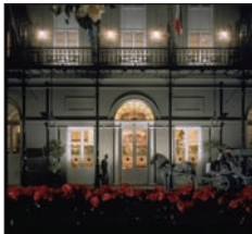
OMNI ROYAL ORLEANS

568 comfortable guest rooms and suites. A perfect place to rejuvenate from a busy day or night exploring New Orleans. The elegance of old New Orleans with the modern conveniences of today. Rooftop pool, fitness area, room service, business center, and multi-lingual concierge. Near many art galleries and great restaurants.